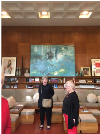
Artistic Endeavor members on a field trip to a Frank Lloyd Wright house.