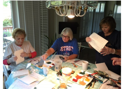
Above: Members working on a hands-on print making project.

Come join us in a relaxing adventure! Hope to see you soon!!