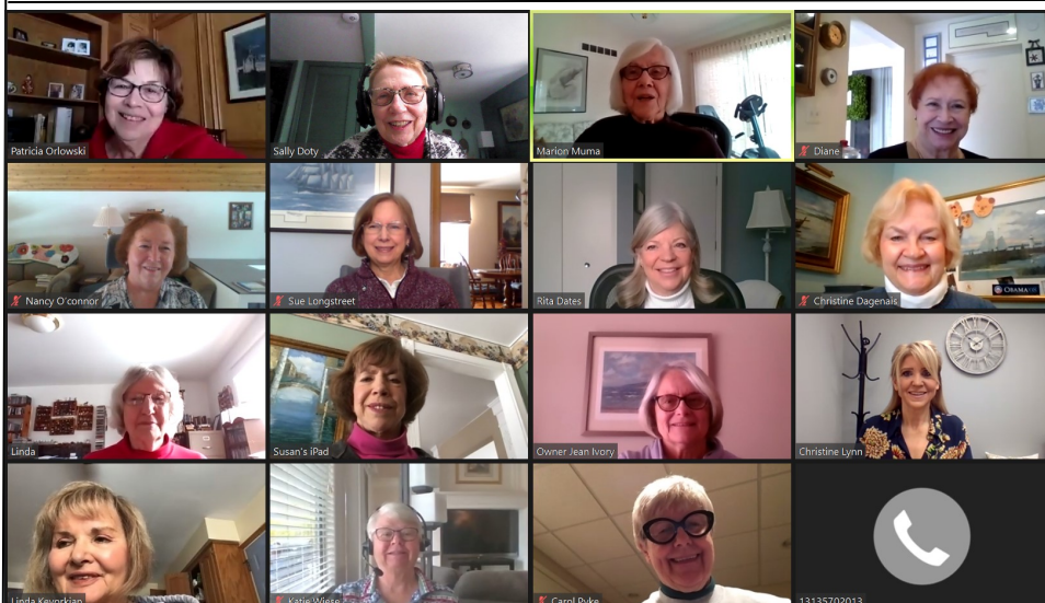
Members of the AAUW Birmingham Branch Board at their Feb.10 meeting.