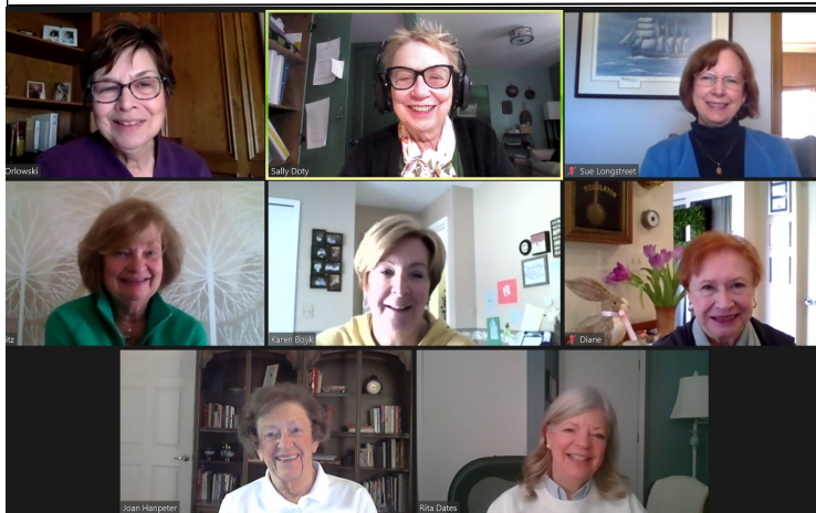
Branch Foundation Board at March 17 meeting.