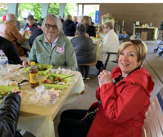
Above: Just a few of the many happy faces to be found at the May 12th annual membership meeting and luncheon.