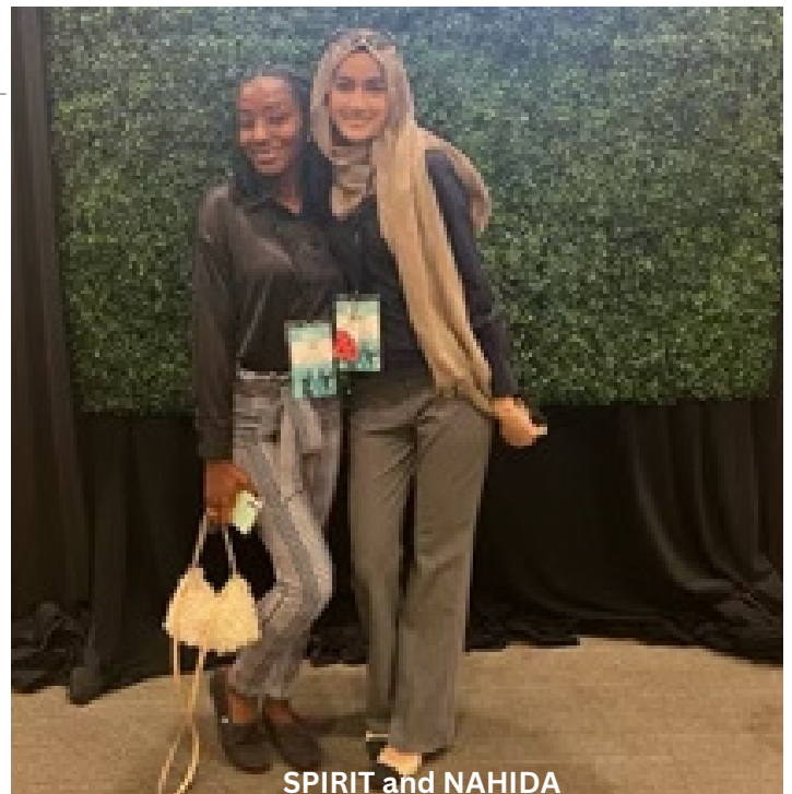
SPIRIT and NAHIDA