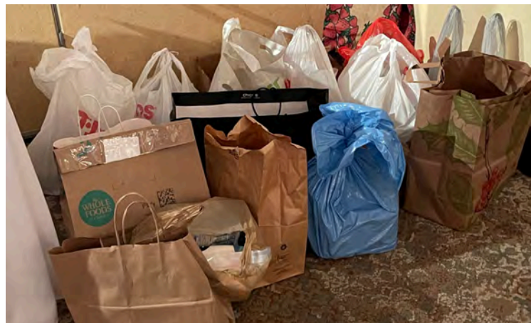
Your donations to the Ruth Ellis Center