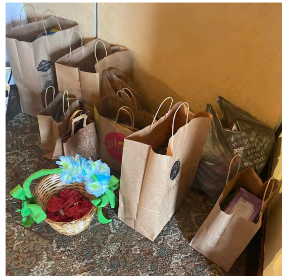
Your donations to Vista Maria