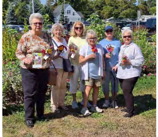
Green Thumbs made bouquets at the Trinity Garden