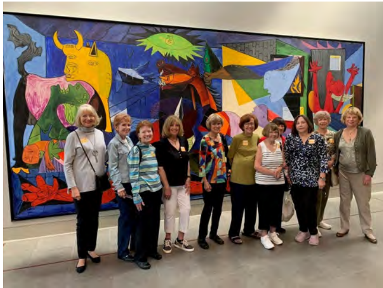
Modern Art Group visited the Flint Art Museum